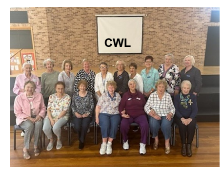
New members always welcome to join our group.

24<sup>th</sup> July Branch meeting 10.15am for 10.30am.